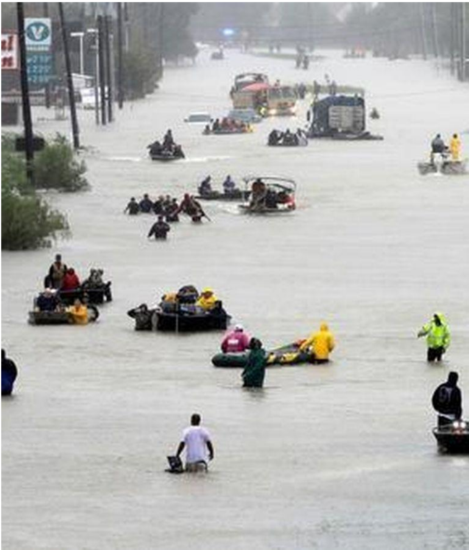
Catastrophic storms, once rare, are almost routine. Is climate change to blame? AUG 30, 2017 | 1:45 PM